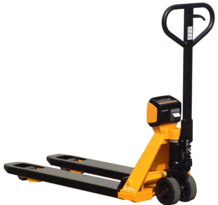
Pallet truck scale